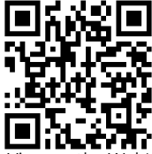
View on the Web!